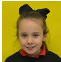
Year 2 Team