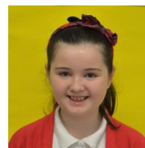
Year 6 Team